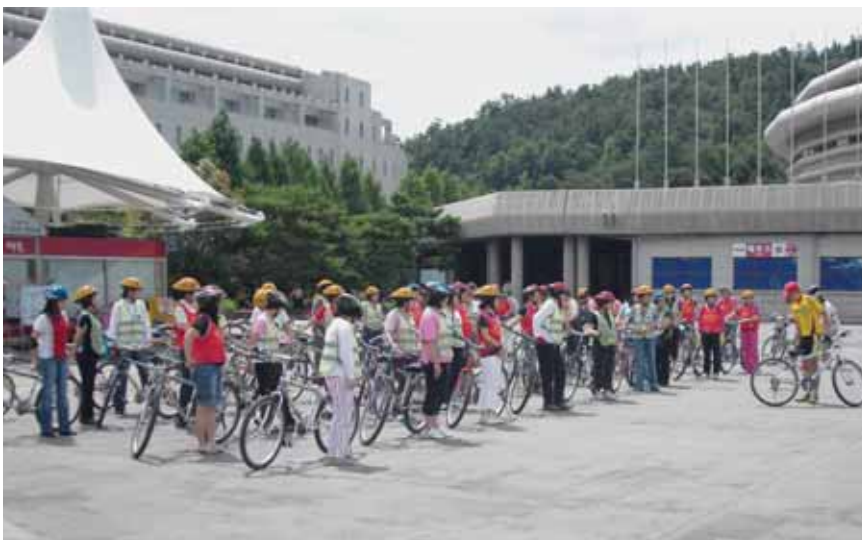
Bicycle safety training

Public incentive: In addition, Changwon created the Republic of Korea's first-ever bicycle insurance program as an incentive for prospective cyclists. The NUBIJA program showcases the importance of integrating technological innovation into a municipal bicycle program, particularly with regard to creating a bicycle loaning