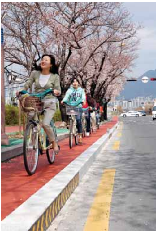
Street-side bike paths

Promotion and expansion of the NUBIJA program will be especially valuable in conjunction with the 1st International Ecomobility Exchange Congress to be held in Changwon in October 2011.